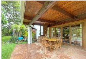
Bedroom 1 outdoor patio