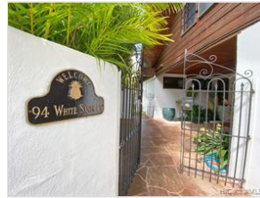
An exotic Beachside residence for the discerning few...