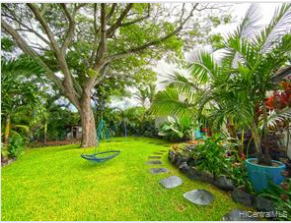
Professional landscaper designed the compound with maximum privacy by curating select specimens on the ground