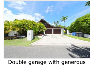
Double garage with generous driveway for additional parking needs.