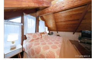
Bedroom 4 in the attic area with sitting area