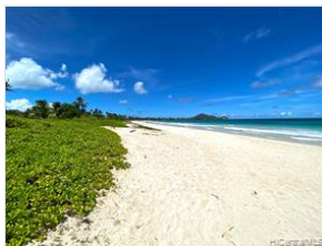
World renowned Kailua Beach Park is just steps away from your own door