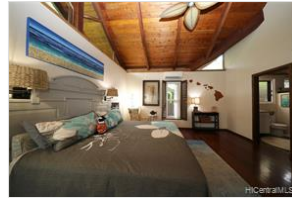
Bedroom 2 offers outdoor private garden