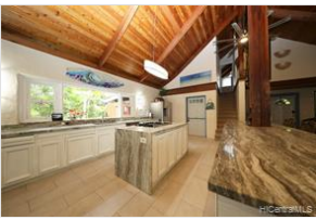
Elongated kitchen island featuring breakfast bar and gas store island