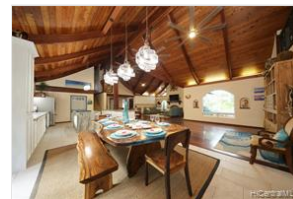
Open floor plan with expansive interiors