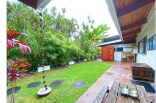
Outdoor shower in separate private garden area