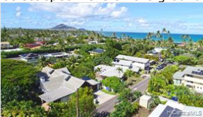
The world famous Kailua Beachside

Information herein deemed reliable but not guaranteed. Generated on 09/16/2022 7:04:12 AM