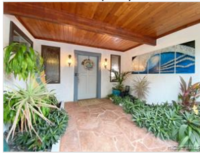
Front door with second Koi pond water feature