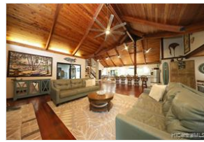
Vaulted ceiling and fireplace anchor the living room quarter