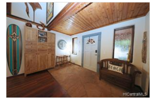
Formal foyer with wooden ceiling details