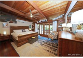
Bedroom 1 offers outdoor patio