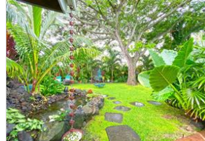
Lush vegetation with Koi pond