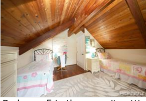
Bedroom 5 in the opposite attic area