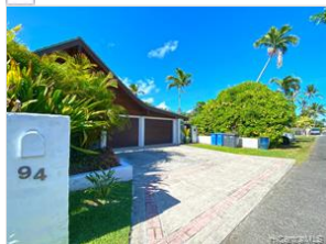
94 White Sands Place is located on a private road with deeded beach access

Click on the arrow to view Additional Photos