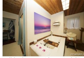
Hall bathroom with tropical SPA-like vibe