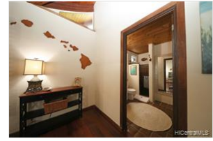
Bedroom 2 ensuite with island flairs