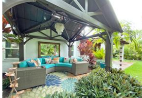
Professionally landscaped garden offers privacy and tranquility