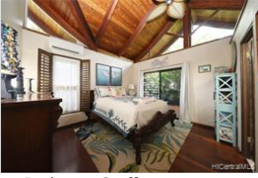
Bedroom 3 offers separate outdoor garden area