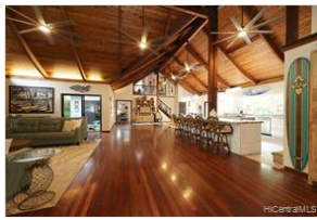
Grand hall connected to various indoor and outdoor living area